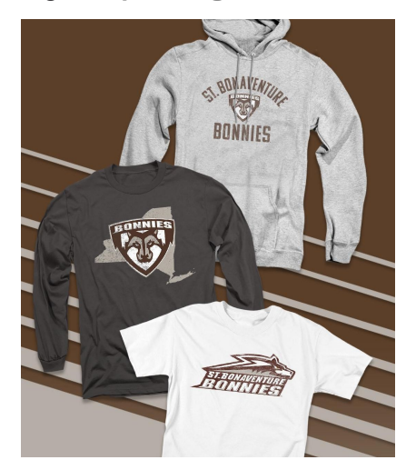
GO BONNIES : Purchase SBU merchandise on Amazon! St. Bonaventure University now has an <u>Amazon store online</u>.

APRIL 15, 16: PROBLEM SOLVING and ROOT CAUSE ANALYSIS , Jamestown Community College, Jamestown, 8 a.m. to 4:30 Thurs, 8 a.m. to Noon Fri. The focus of this 12-hour course is to review and give participants the basic concepts of problem solving and root cause analysis. The courses are designed to help participants understand the problem-solving process and how it is used to define the problem, analyze the problem, develop a plan to fix the problem, and implement the solution and conduct proper follow-up. Problem solving methods offered include 8D, PDCA, A3 and DMAIC. The fee is $449 per person. Registration closes: April 8, 2021. For more information or to register, please go online.