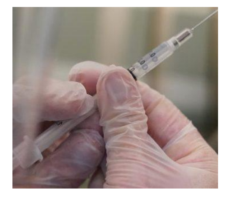
TIME OFF for VACCINATION: Cuomo Signs Legislation Granting Employees Time off to Receive COVID-19 Vaccination <u>More info online...</u>

WEDDINGS/CATERED EVENTS Can Now Resume Statewide. <u>Detailed guidance</u> for in-person and catered events can be found here.