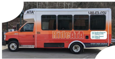
Upper Allegheny Health System and Area Transportation Authority of North Central Pennsylvania have made an agreement for patient transportation that will begin May 1.

HOSPITAL TRANSPORTATION: Upper Allegheny Health System will begin transporting of non-emergency patients and visitors at both Olean General Hospital and Bradford Regional Medical Center. It will be demand-based and at no cost to those be transported.