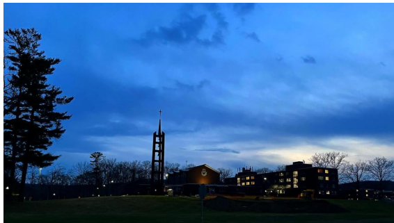
ANOTHER SPECTACULAR #bonas

HOW CAN I GET MY EVENT/INFO LISTED: GOACC member businesses/organizations are encouraged to send GOACC their business/organization events and activities to be listed in the cybernews. Non-member's events will only be listed in GOACC's web calendar as well as its printed events brochure, pending when the information is received.